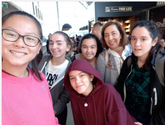
Modlin airport, Poland, September 2018